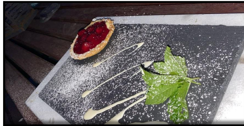
Red cherry tart with crème patisserie (crème pat )